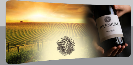
20' x 7.5' (5.9 m x 2.3m)