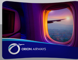
10' x 7.5' (3 m x 2.3m)