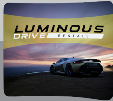
8' x 7.5' (2.4 m x 2.3m)