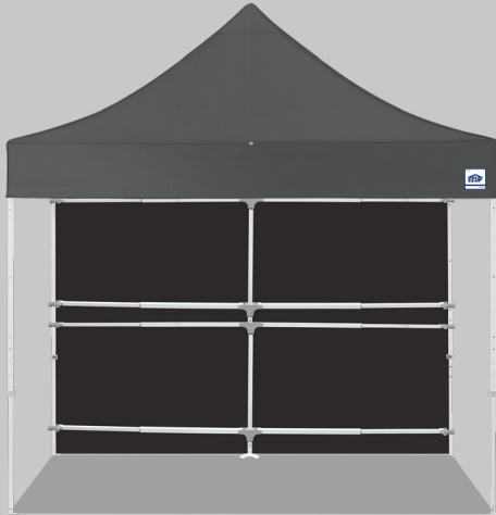
CANOPY AND SIDEWALL NOT INCLUDED