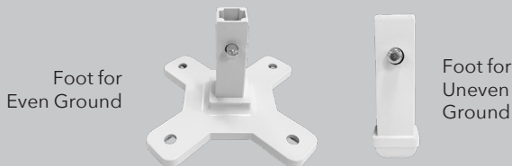
Foot for Even Ground