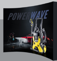
8' x 7.5' (2.5 m x 2.2 m)