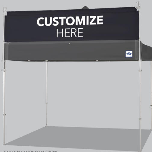
CANOPY NOT INCLUDED

The Marquee Banner instantly elevates your messaging and boosts the visibility of your brand. This fully customizable and easy to install banner extends above your canopy making your setup shine at farmers markets, sporting events, festivals, and beyond.