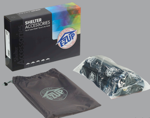
*Accessory Tote Included

UP for Storage. UP for Privacy. UP for Everything.™