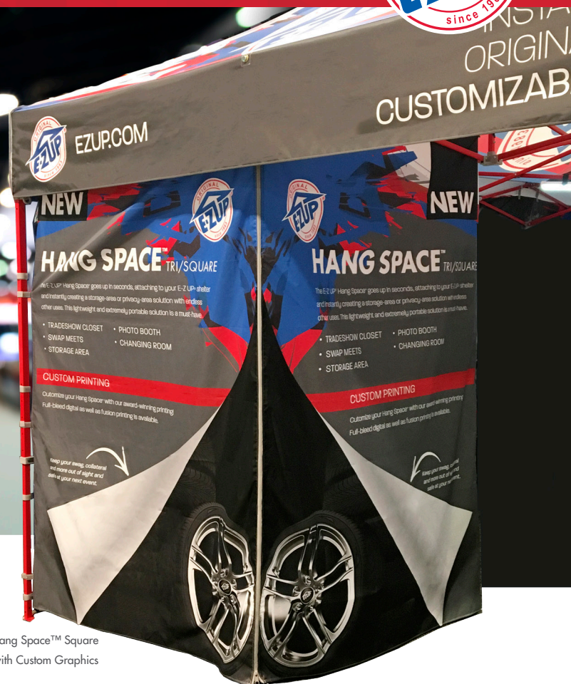
Hang Space™ Square with Custom Graphics

*Ask a representative for specific customs options.