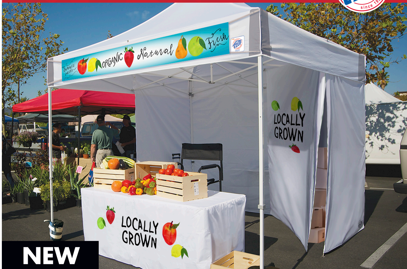
Hang Space™ Tri in White with Custom Graphics