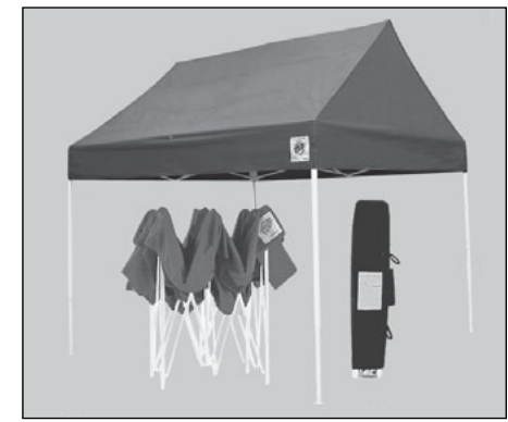
"Sets Up in Seconds!"™