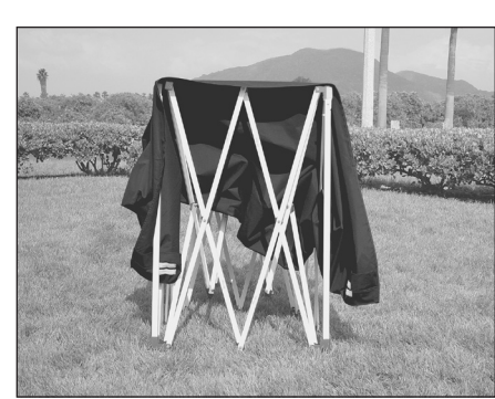
*2. Gently unfold the fabric top and place it over the open frame.

• Place your E-Z UP® frame in the center of area to be shaded. With partner on opposite side, grasp outer legs, lift off the ground, and step backwards, stopping at full arms length.